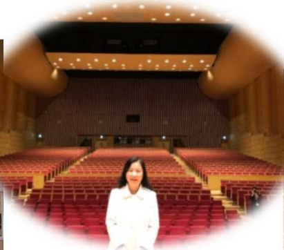
Shelter Nanyo Hall