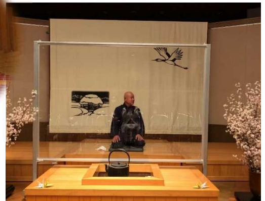
Yuzuru no sato