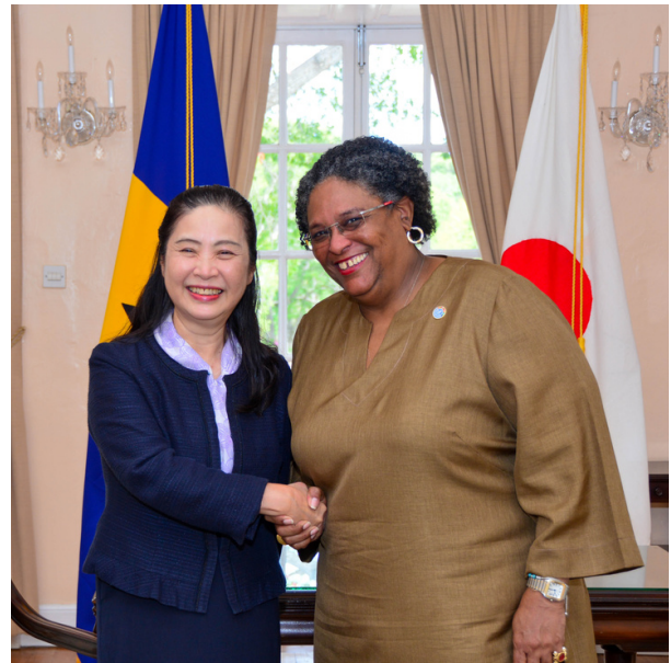
L-R Ambassador H.E. Ms. Fukushima with Prime Minister of Barbados the Hon. Mia Mottley