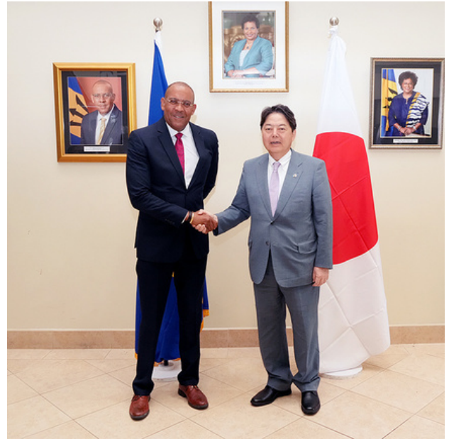
L-R Minister of Foreign Affairs' of Barbados, the Hon. Kerrie Symmonds and Minister of Foreign Affairs of Japan, Mr. Hayashi.

During each meeting, Minister HAYASHI reaffirmed Japan's unwavering commitment to provide much-needed assistance in various areas such as the environment, climate change and disaster risk reduction, areas of pressing concern for small island states like Barbados. During his short visit to the island, Minister HAYASHI also hosted a special luncheon for people residing in Barbados who actively foster cross-cultural exchange between the two states.