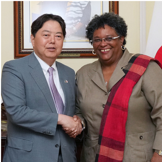
L-R The then Minister for Foreign Affairs of Japan, Mr. Hayashi with Prime Minister of Barbados, the Hon. Mia Mottley.

On May 01, 2023, then Minister HAYASHI visited Barbados, becoming the first Minister for Foreign Affairs of Japan to do so. Following a welcome dinner by the Prime Minister, the Hon. Mia Mottley, Minister HAYASHI paid a courtesy call to Prime Minister Mottley and Minister of Foreign Affairs and Foreign Trade, the Hon. Kerrie Symmonds on May 02.