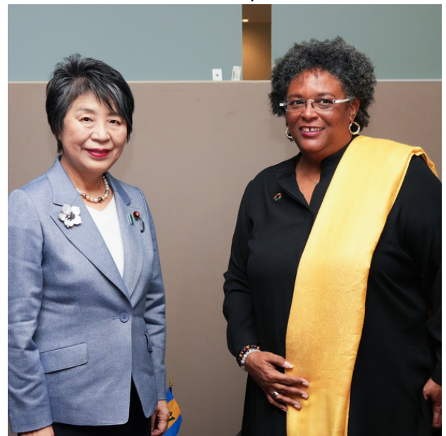
L-R Minister for Foreign Affairs of Japan, Ms. KAMIKAWA and Prime Minister of Barbados, the Hon. Mia Mottley.

Just one month later, while attending the "Summit for a New Global Financing Pact" in Paris, Minister HAYASHI and Prime Minister Mottley reunited and held informal talks. This trend in the intensification of bilateral meetings continued after the appointment of the new Minister for Foreign Affairs of Japan, Ms. KAMIKAWA Yoko, who in September, met with Prime Minister Mottley in New York while attending the United Nations General Assembly.