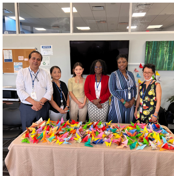
Embassy staff with Origami Workshop Participants at the Ross University School of Medicine in Barbados.

In June, the Embassy of Japan in Barbados hosted a colorful origami workshop, teaching Barbadians the ancient Japanese art of paper folding. By the end of the session delighted participations showed off their colorful creations and a new skill. This scene of attendees diligently crafting their first origami piece with Japanese staff is a poignant reminder that sometimes cultural gaps can be bridged one fold at a time.