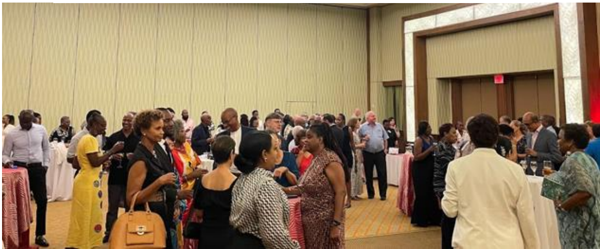
Guests enjoying the reception