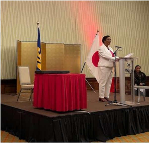
The Honourable Sandra Husbands