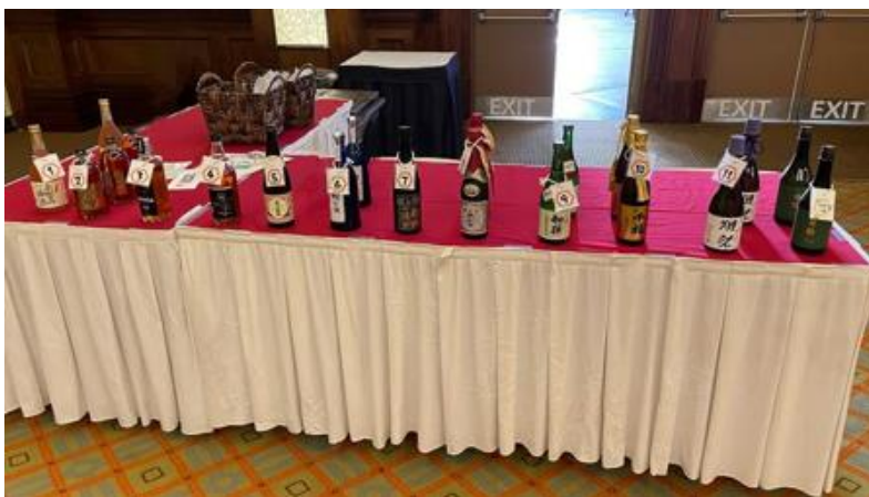
Japanese sake booth