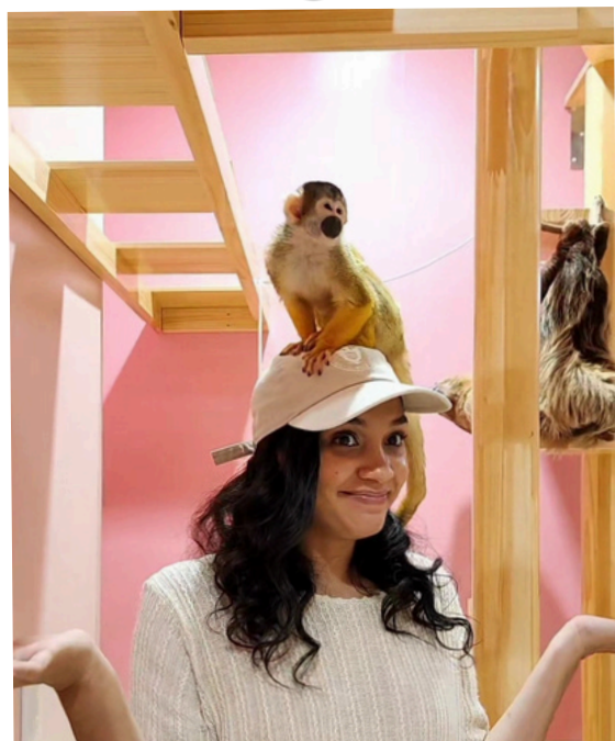
Monkeying around in Tokyo!