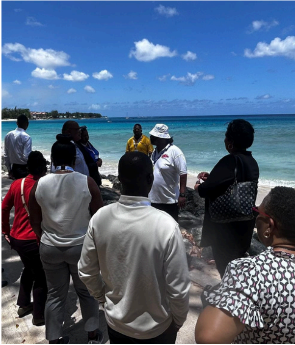
Participants of site visit during UPU workshop funded by the Japan Fund held in May, 2024