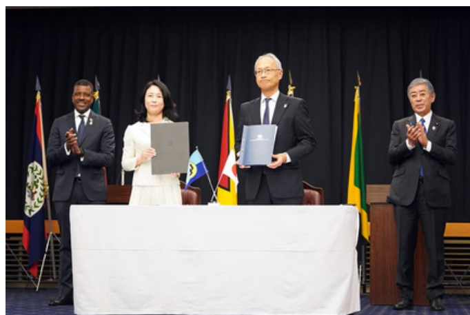
The Signing Ceremony.

From December 12 to 15, 2024, a Barbadian delegation led by the Honourable Kerrie D. Symmonds, Minister of Foreign Affairs and Foreign Trade, visited Japan to attend the Eighth Japan-CARICOM Ministerial-Level Conference. Following this meeting "The Project for Industrial Development and Technology Transfer in the Member States of the Caribbean Community" , a Japan-funded grant aid project in partnership with UNIDO, was signed. This 730-million-yen initiative will provide equipment, technical cooperation, and training to CARICOM countries, focusing on water, agribusiness, and industrial diversification and aims to aid CARICOM's sustainable development