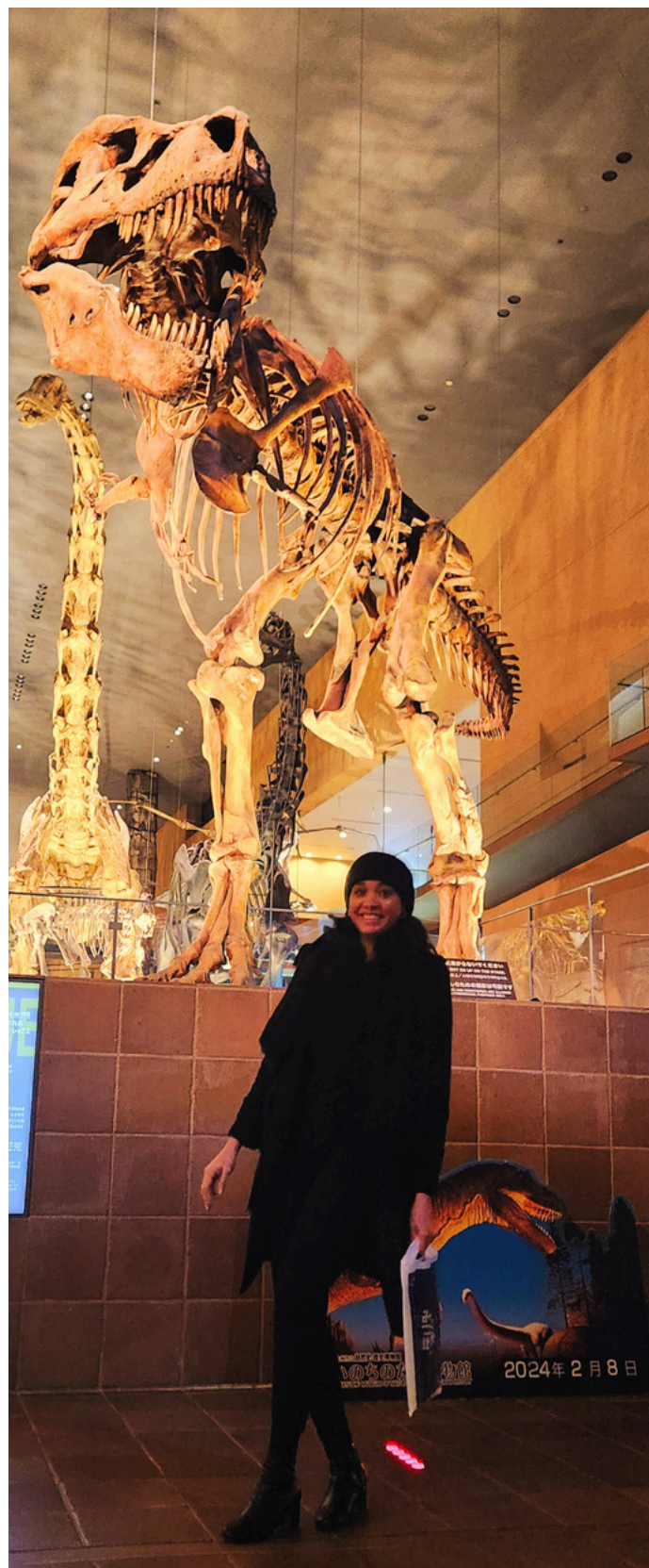
Kitakyushu Museum of Natural History & Human one of the largest museums in Western Japan.

Japan offers a unique experience for everyone, and I encourage anyone visiting to let their interests and passions guide them, all while keeping an open mind. The Sophia-APIC-UWI Programme is a fantastic opportunity for those passionate about the environment and sustainability. If that resonates with you, this program could be the key to unlocking your future career goals.