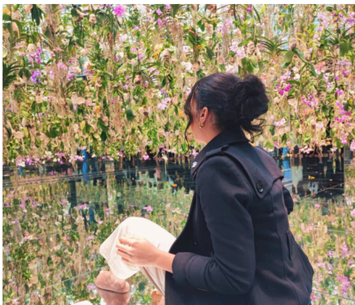
Team Labs (Tokyo) - This art facility utilizes digital technology to create an immersive experience.

One of my most memorable experiences in Japan was visiting the Kitakyushu Museum of Natural History & Human History. As someone deeply passionate about learning, I could have spent days exploring the exhibits. Seeing dinosaur fossils and learning about different eras of Japanese history were unforgettable experiences. Another highlight was attending the Sawara Grand Festival, where I marveled at the craftsmanship of the giant floats and enjoyed the traditional music. I also found great joy in visiting Atami, where the breathtaking landscape left me in awe, and at Team Labs in Tokyo, I was immersed in the beauty of the floating flower garden. My time in Japan has been filled with so many wonderful experiences that it's hard to pick just a few to share.