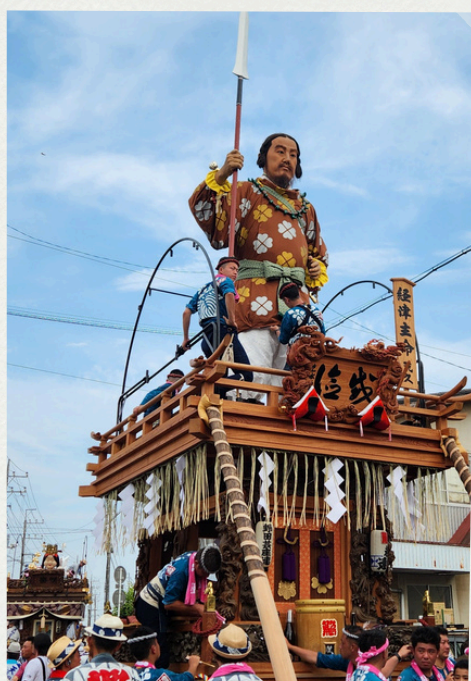
Sawara Grand Festival (Chiba Prefecture)

This centuries old float festival takes place not once but twice a year! The festival has even been recognized as Intangible Cultural Heritage by UNESCO. Witnessing this event is truly one of my favourite memories.