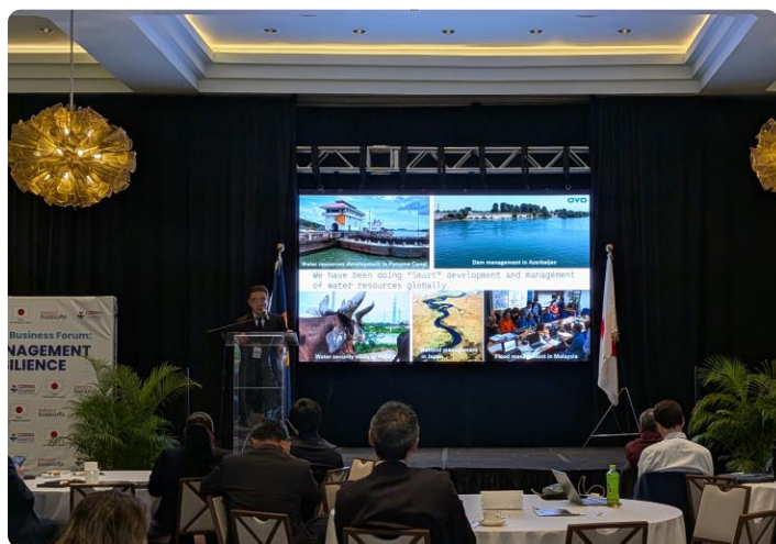
Presentation by Japanese company, OYO Corporation, one of many presentations showcasing the innovative technologies from Japanese companies.

The event featured presentations from participating Japanese companies as well as local agencies, offering insights into cutting-edge technologies and opportunities for collaboration. Attendees also had the opportunity to engage directly with company representatives at their exhibition booths. The forum concluded with a networking reception, enabling participants to build connections, exchange ideas, and explore potential partnerships aimed at advancing sustainable development in Barbados.