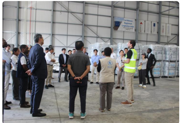
Japanese delegation touring the Caribbean Regional Logistics Hub, guided by staff from United Nations World Food Programme.