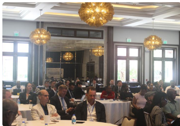
The forum brought together over 80 attendees from various sectors.