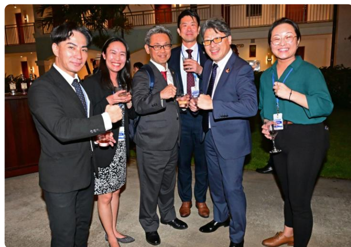
Attendees sharing a light moment during the closing reception of the Japan-Barbados Business Forum.