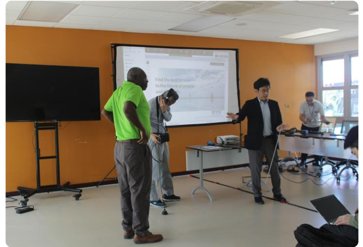
Japanese technology demonstration during a meeting with the Barbados Water Authority.