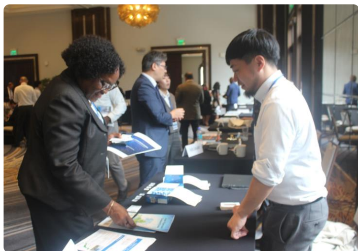
Attendees visiting the exhibition booths.